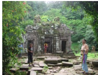
Khong Island and Wat Phou